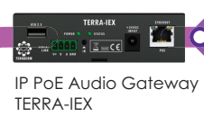
IP PoE Audio Gateway TERRA-IEX