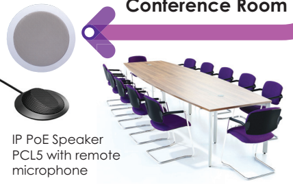
IP PoE Speaker PCL5 with remote microphone