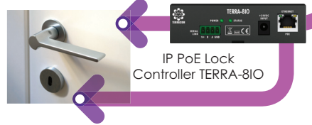
IP PoE Lock Controller TERRA-8IO