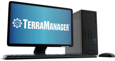
Management Server IPMS